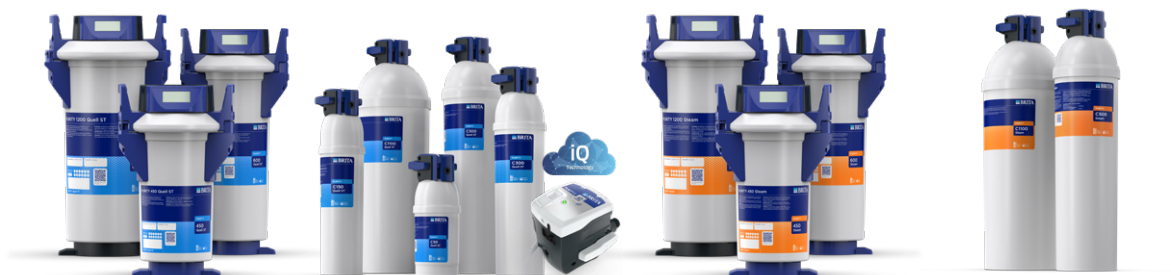
PURITY Quell ST PURITY C Quell ST / PURITY C iQ PURITY Steam PURITY C Steam

This is an overview of the complete range of PURITY filtration products, designed specifically for catering professionals. BRITA Professional has the right solution for you, providing the ideal water for your needs – no matter what the composition of your mains supply.